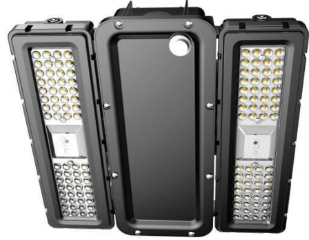
30W / 60W